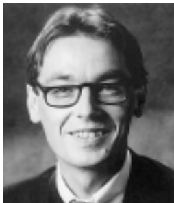
Claus Otto Scharmer

H ealthcare systems around the developed world are in crisis. Surging expenses, aging populations, and growing needs have pushed many systems to the brink. Across Europe, especially, where national health systems trace their roots to Bismarck, Beveridge, and other social reformers of the 19th and early 20th century, citizens have begun to question the future of the systems that have historically seen to their health and well-being. Analysts in Germany have warned that their “system will collapse under its own weight” without massive reform. “The piecemeal reforms enacted to date are hardly adequate to the task,” they add. 1